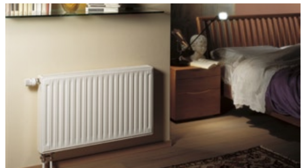
DeLonghi Ultimate Radiator

It is preferable that the radiator system can emit all the heat produced without boiling. In practice this means there should be no thermostatic control for the radiators.