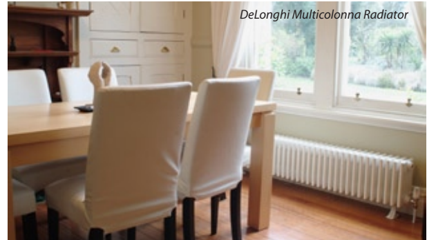
DeLonghi Multicolonna Radiator

The circulating pump is controlled by a thermostat attached to the flow pipe leaving the wetback. This ensures that the pump runs only when the water in the pipe is above a set temperature