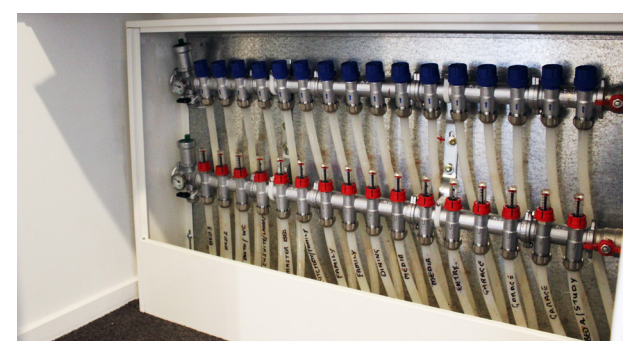
*Underfloor manifolds can be controlled by a single thermostat or multiple thermostats, the flow through each of the loops is then managed to ensure an even comfort level throughout the each zone

A manifold functions as the hub of your underfloor heating system, it connects the heat source (which warms the water) and the underfloor pipes which distributes radiant warmth around your home. Underfloor manifolds are able to control multiple zones at once, allowing each zone to be different temperatures depending on what the user desires<sup>*</sup>. Underfloor pipes are connected to the manifold