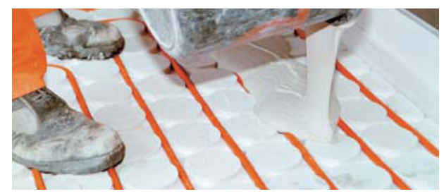
Compact Filling Compound