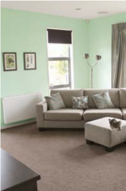
The PHD Universal radiator is designed with efficiency and comfort in mind.